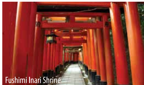
Fushimi Inari Shrine