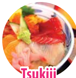
Tsukiji Fish Market