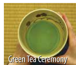
Green Tea Ceremony