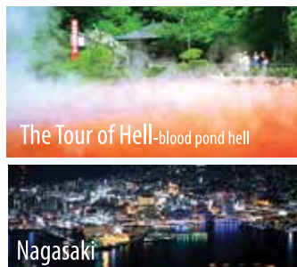
The Tour of Hell-blood pond hell