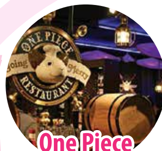
One Piece Restaurant